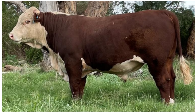
Lot 28 – Glenholme Terrence