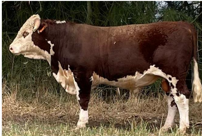
Lot 14 - Kirraweena Theodore