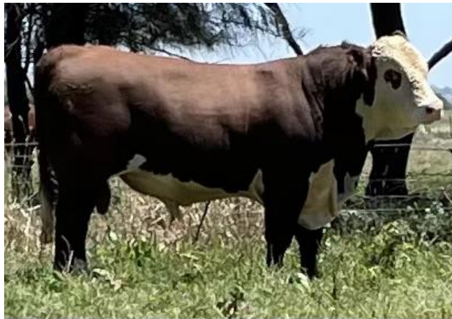
Lot 19 – Glenholme Commercial T118