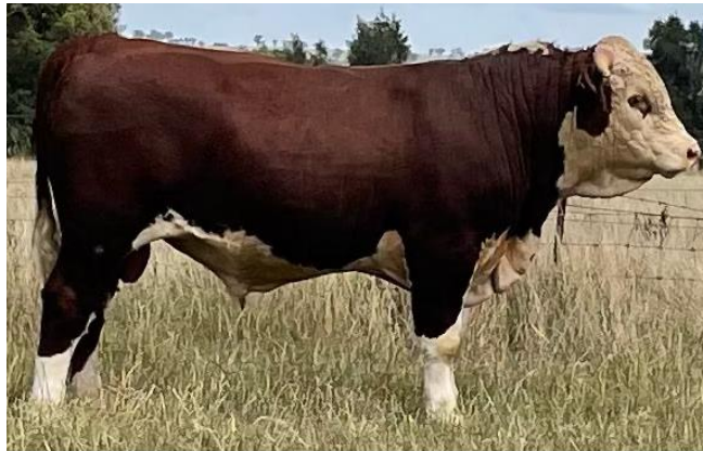
Lot 11 – Kirraweena Tamir