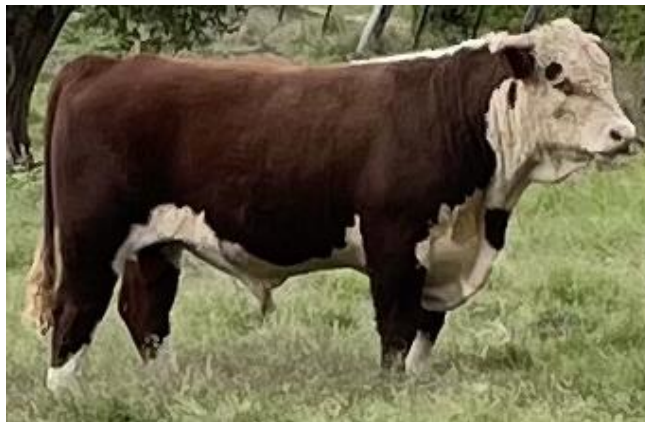
Lot 27 – Glenholme Tanner