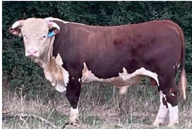
Lot 12 – Glenholme Tierney