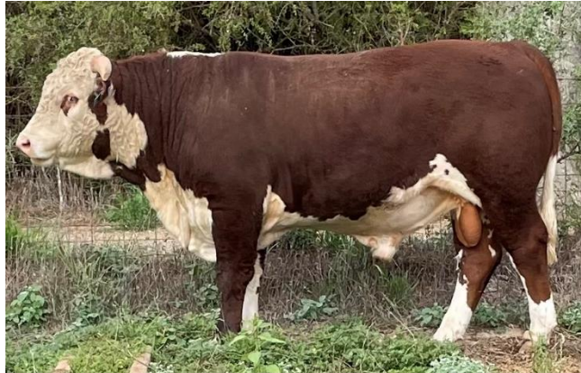
Lot 25 – Glenholme Taree