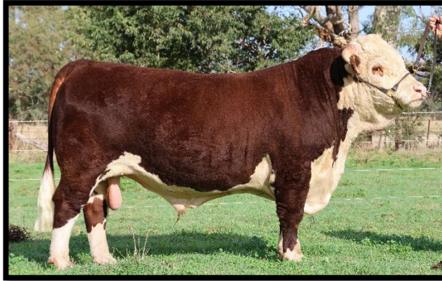
Kirraweena Silver Fern AI (H) (Sire: Pute Nascar) Sold Wodonga 2023 for $24,000 to Tondara Herefords

CONSISTENTLY BREEDING QUALITY, EASY DOING, QUIET HEREFORDS SINCE 1953