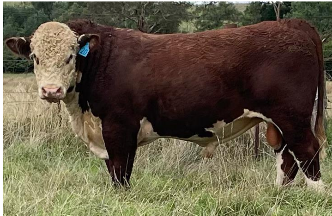
Lot 20 – Glenholme Tyrone