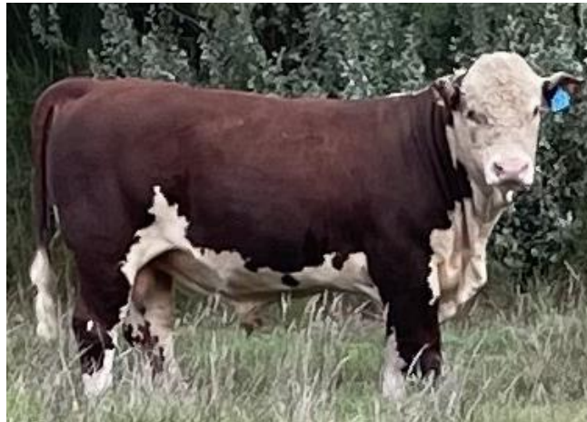
Lot 22 – Glenholme Titan