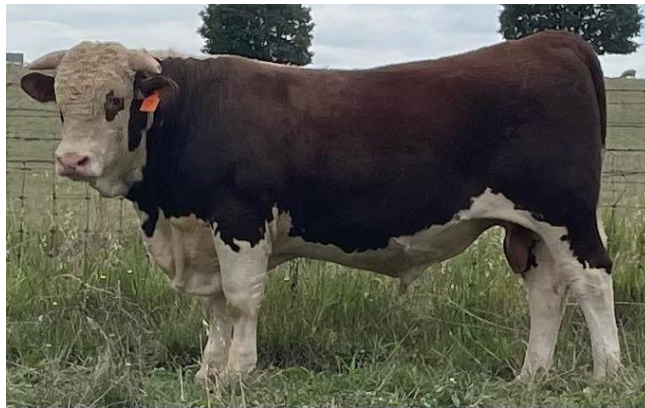
Lot 7 – Kirraweena Trent