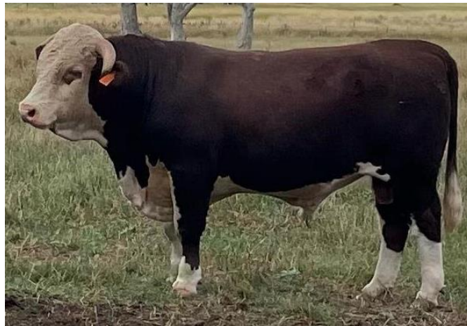
Lot 10 – Kirraweena Taylor T222