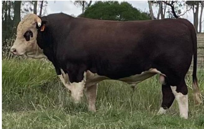
Lot 6 – Kirraweena Terence