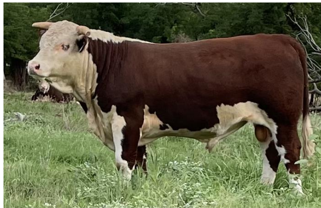
Lot 26 – Glenholme Trevor