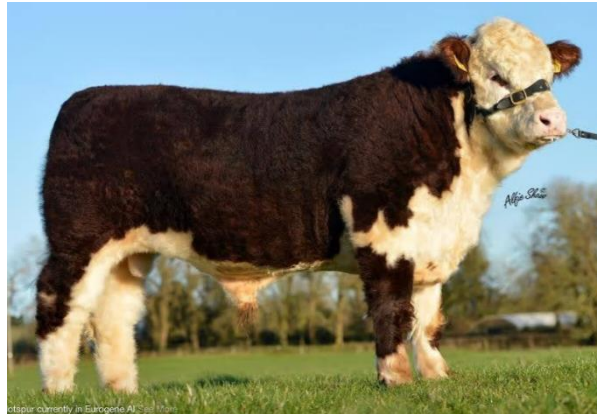
Trillick Hotspur (H) AI Sire. Semen imported from Ireland