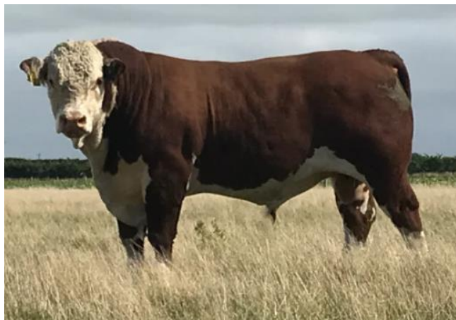
Pute Nascar N13 (H) AI Sire. Semen imported from New Zealand