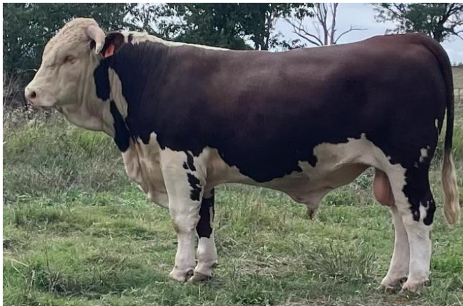
Lot 4 – Kirraweena Thor