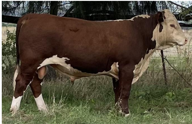
Lot 23 – Glenholme Temora