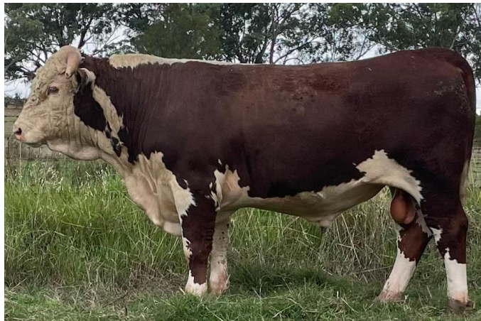
Lot 8 – Glenholme Truman