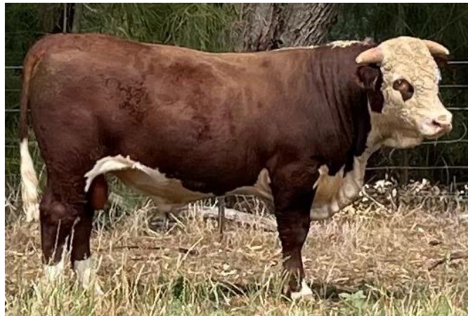
Lot 9 – Glenholme SM Tommy