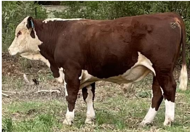
Lot 24 – Glenholme Turbo