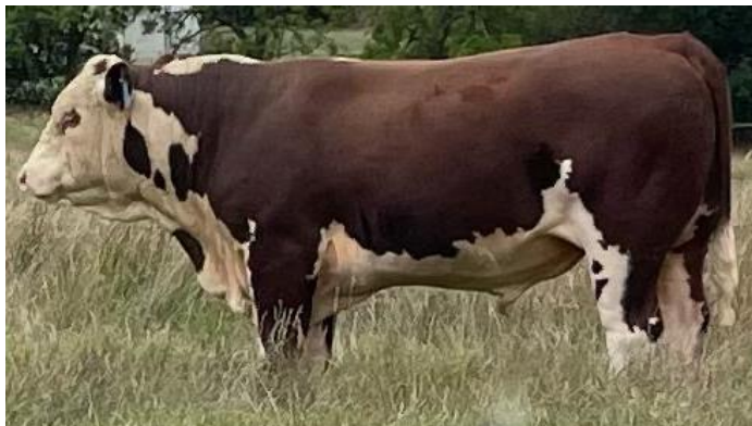
Lot 21 – Glenholme Tenterfield