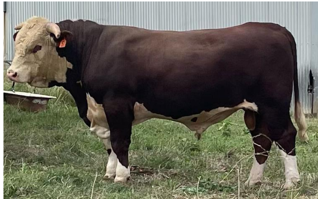
Lot 5 – Kirraweena Toby