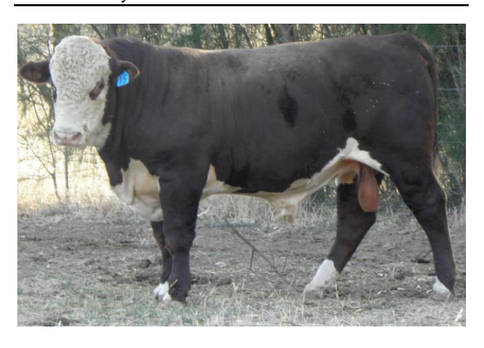
Lot 15 - Glenholme Kevin

Notes: Two full brothers have been shown and sold at Wodonga. Lindy Loo D072 placed first in her class at the Sydney Show as a heifer. Top 10% Retail Beef Yield