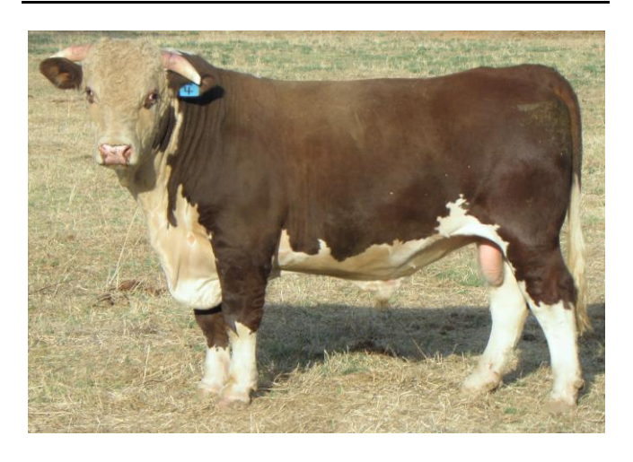
Lot 4 – Glenholme Karl