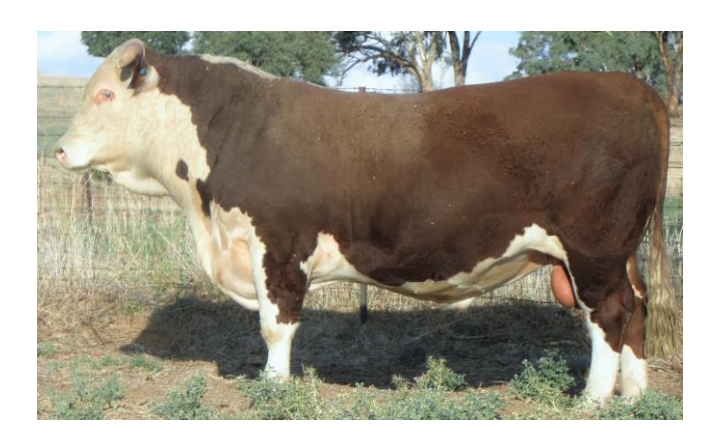
Lot 5 - Glenholme Kilwillie

Notes: Out of one of our top performing cows. Sister by Talbalba Yogi will be offered at Sydney this year in the Inaugural Whiteface Female Sale. Top 10% Retail Beef Yield.