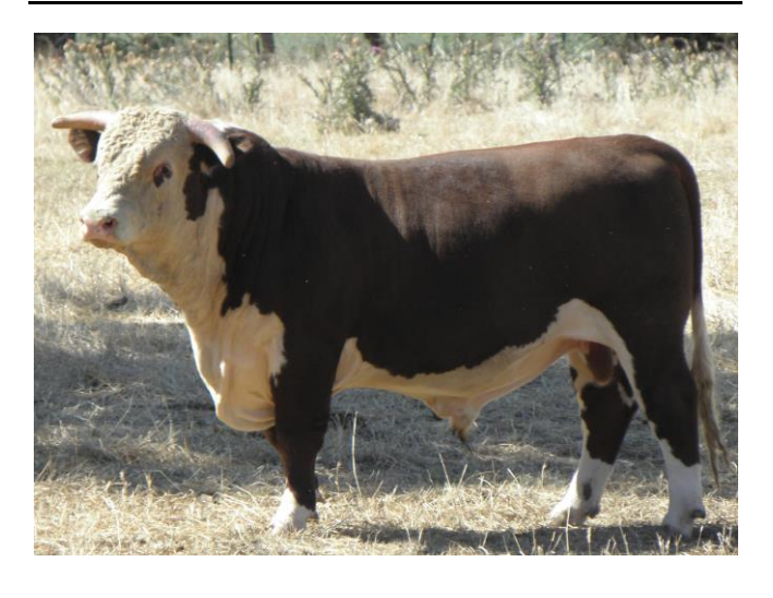
Lot 21 - Kirraweena Keith

Notes: Top 5% of the Breed for Birth Weight, Rib and Rump Fat.