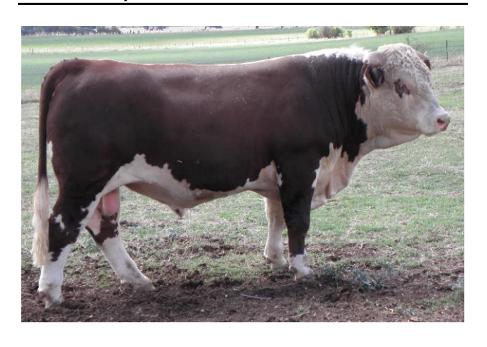
Lot 7 – Glenholme Kruger