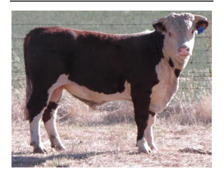
Lot 29 - Glenholme Kirkpatrick

Notes: Out of one of Jack's cows. Tremendous smoothness through the shoulders, considered retaining him for use on our heifers as a cover bull.