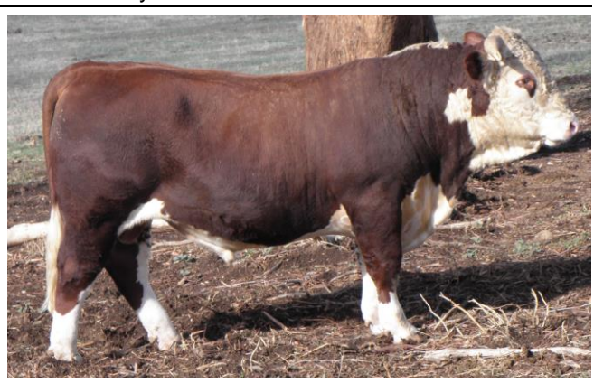
Lot 17 - Kirraweena Keane