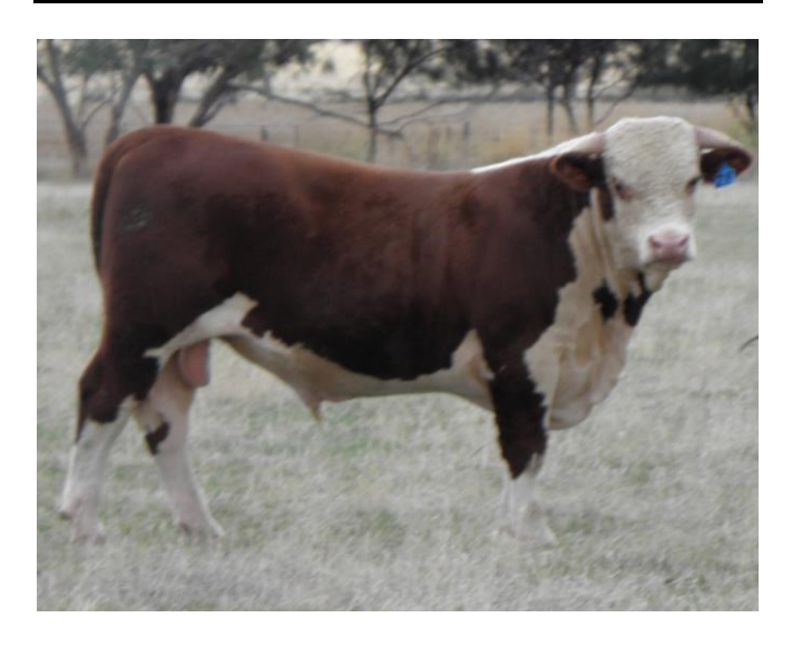
Lot 28 - Glenholme Kearney

Notes: Top 10% of the breed for Retail Beef Yield