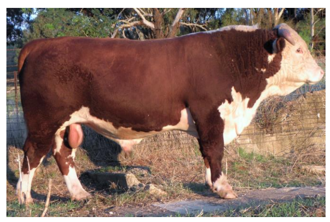
Lot 22 - Kirraweena Kilmore

Notes: This bulls bloodlines have been DNA tested in the last 12 months and it has been found that there has been no genetic drift between the original Herefords in England and his bloodlines, making him a genuine Pure Hereford. Top 10% of the breed for Birth Weight and Rump Fat. He is a nice bull – the photo does not do him justice.