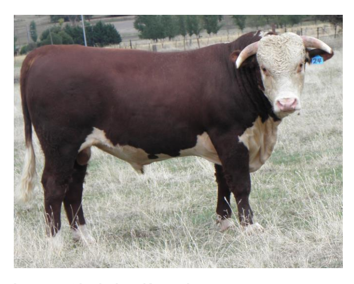
Lot 24 - Glenholme Konrad

Notes: Top 5% of the breed for Retail Beef Yield