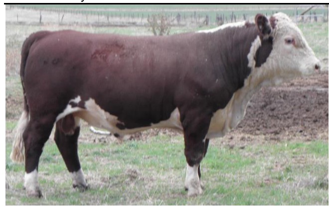
Lot 13 - Glenholme Knott