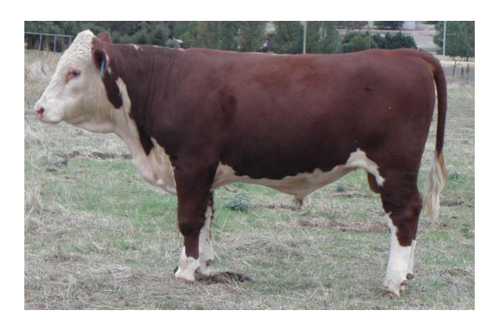
Lot 16 - Glenholme Knight

Notes: Heifer's first calf. Top 10% of the Breed for Marbling (IMF%)