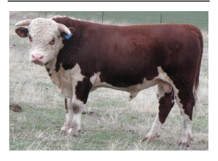
Lot 27 - Glenholme King

Notes: Top 5% of the Breed for Retail Beef Yield