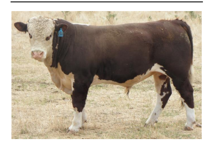
Lot 12 – Glenholme Kyle