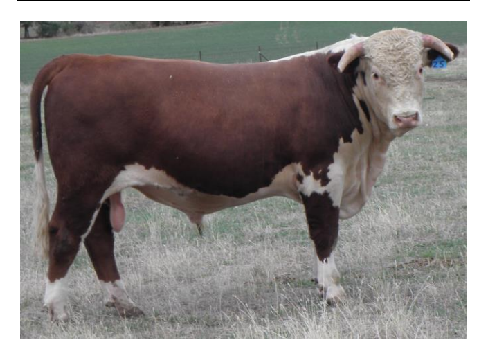
Lot 25 - Glenholme Kermit

Notes: Full brother to Glenholme Juan sold at Wodonga in 2015. Mother will be 14 this year. Top 5% of the Breed for Retail Beef Yield