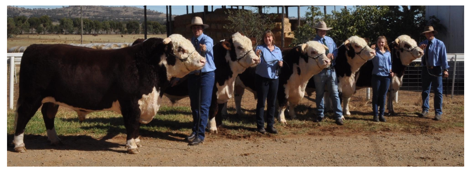
2015 Wodonga Sale Bulls Kirraweena Glenholme Herefords CONSISTENTLY BREEDING QUALITY, EASY DOING, QUIET HEREFORDS SINCE 1953