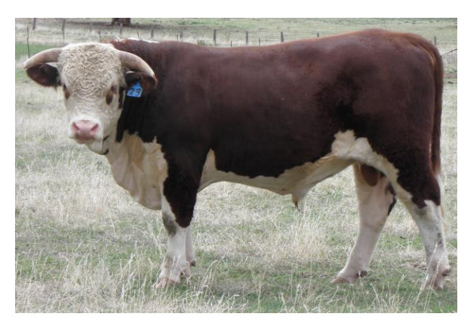
Lot 23 - Glenholme Kidman

Notes: Top 5% of the breed for Retail Beef Yield