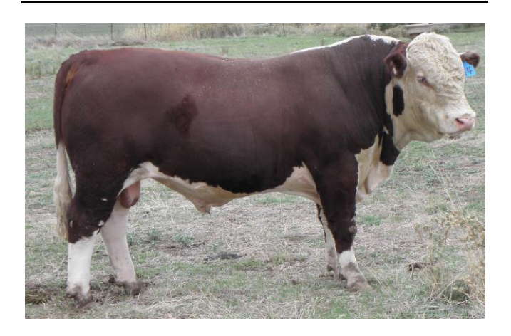
Lot 14 – Kirraweena Kapper

Notes: Breedplan figures available on the day. Rare opportunity to purchase a Poll Hereford son out of our Kirraweena line of cows.