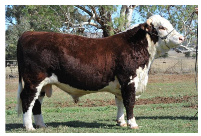
Glenholme Juan – our top price bull at Wodonga 2015 – sired by Talbalba Yogi. Full brother to Lot 25, Glenholme Kermit in this year's sale