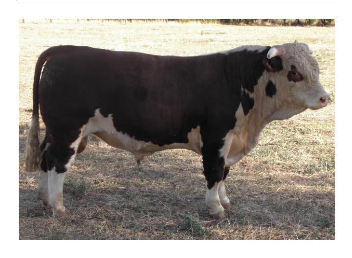
Lot 6 – Glenholme Kurt