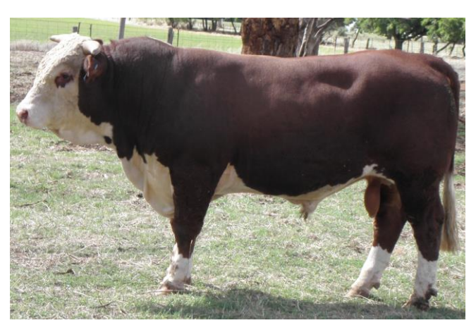
Lot 8 - Glenholme C Kristian

Notes: Cassie's Bull. Top 5% for Retail Beef Yield. Purchased by: Price: