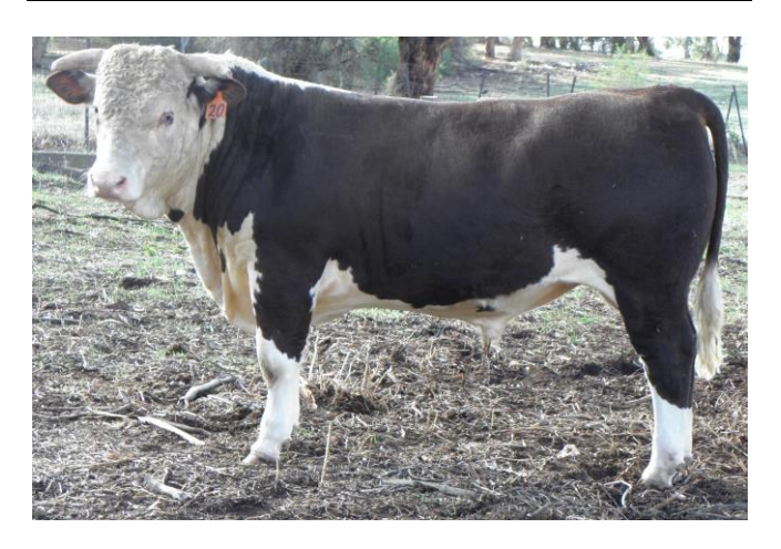
Lot 20 - Kirraweena Kirk

Notes: Top 10% of the breed for Marbling (IMF%)