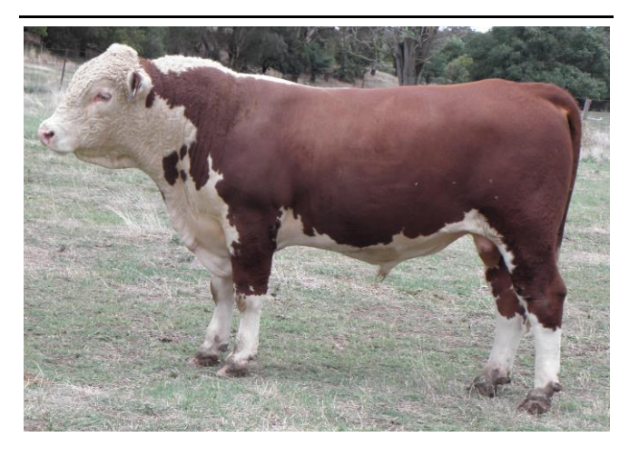
Lot 10 - Glenholme Kamal