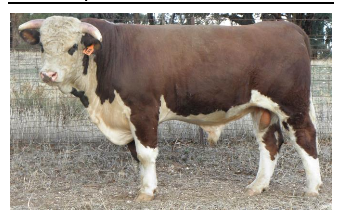
Lot 18 - Kirraweena Keegan

Notes: Sire sold to Neil Fry. Heifer's first calf. Top 5% Retail Beef Yield.