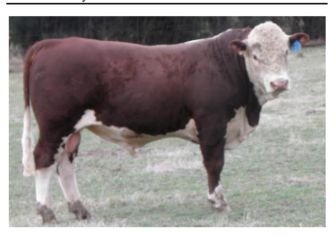
Lot 11 - Glenholme Kirwan

Notes: Top 1% of the Breed for Retail Beef Yield.