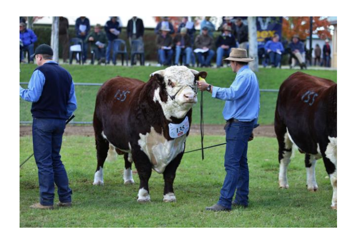
Glenholme Johnson, sold at Wodonga 2015, sired by Kirraweena Australia

Don't hesitate to contact us. We have always looked after our clients, however, we would strongly suggest that buyers look at insuring their purchases. Bulls have been prepared to show their potential whilst they are ready to use.