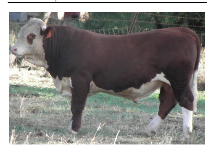
Lot 19 - Kirraweena Kingston