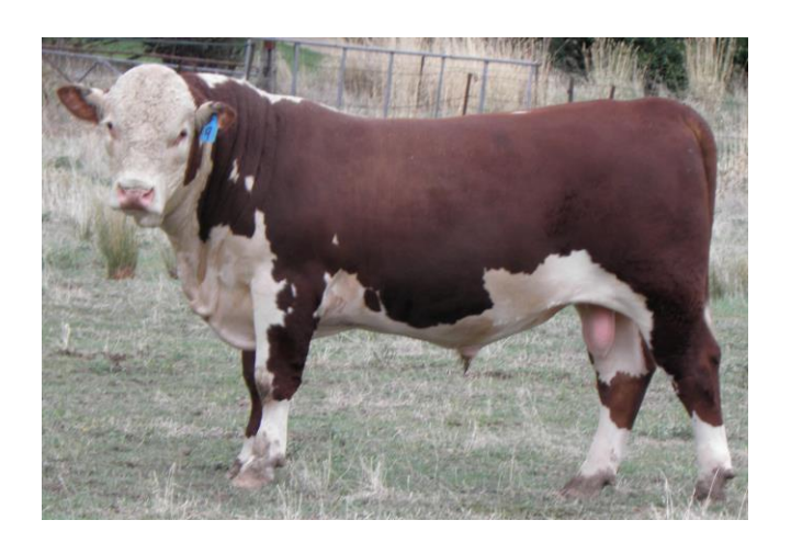
Lot 9- Glenholme Kobe

Notes: Top 5% of the breed for marbling (IMF%).