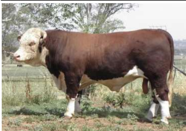
Lot 4 – Glenholme Norman