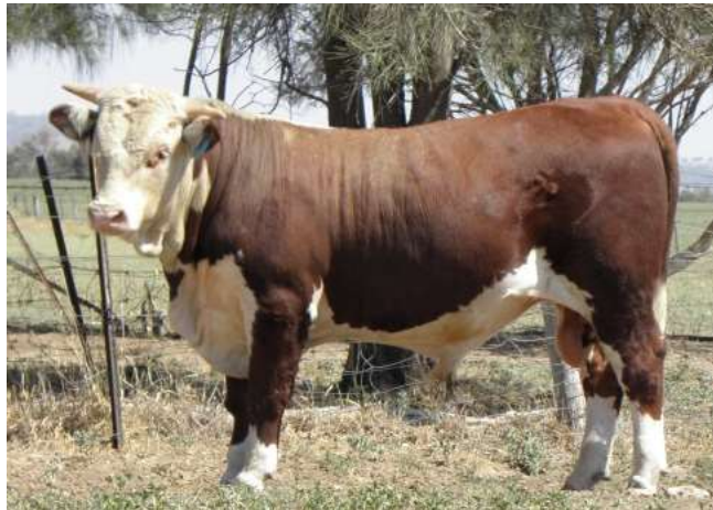
Lot 21 – Glenholme Newton