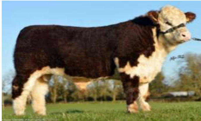
Trillick Hotspur Future AI Sire. Semen imported from Ireland