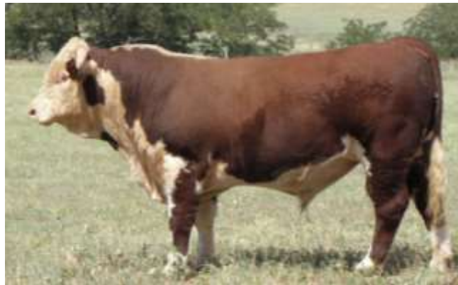
Lot 17 – Kirraweena Norton