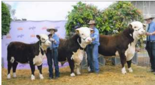
2016 Champion Breeders Group Sydney Royal Kirraweena Glenholme Herefords

Harden Show 2018 – Kirraweena Doreen M229 was the Senior and Grand Champion Female.