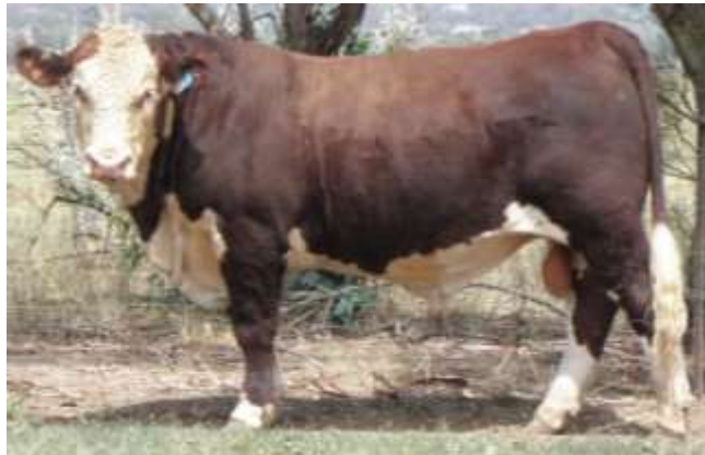
Lot 12 – Glenholme Neil