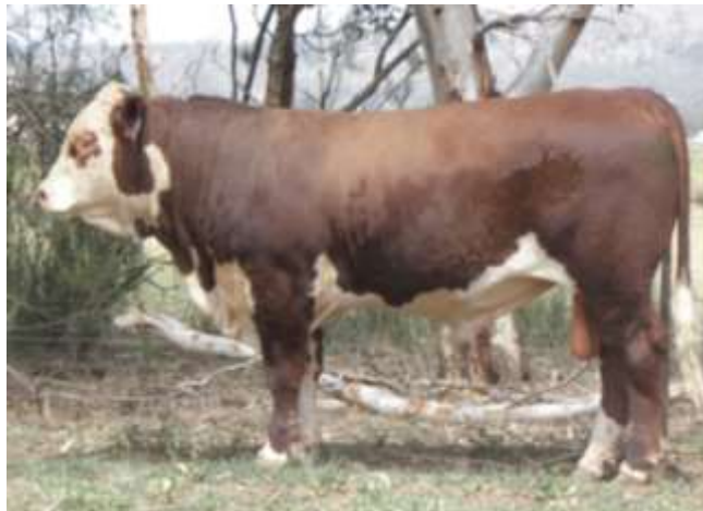
Lot 13 – Glenholme Noah