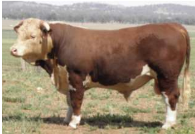
Lot 15 – Kirraweena Nike