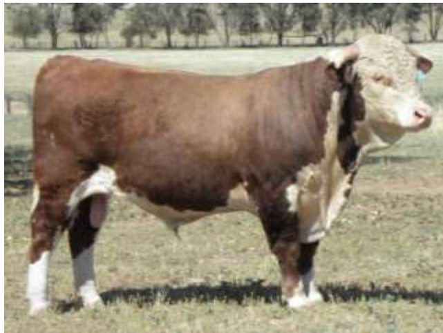
Lot 5 – Glenholme Nightingale