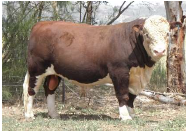
Lot 10 – Glenholme Napoleon