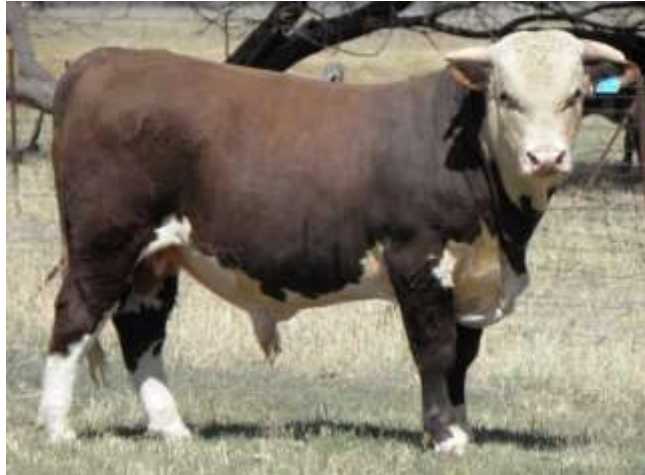
Lot 19 – Kirraweena Nice