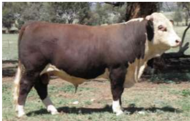
Lot 8 – Glenholme Nicholas