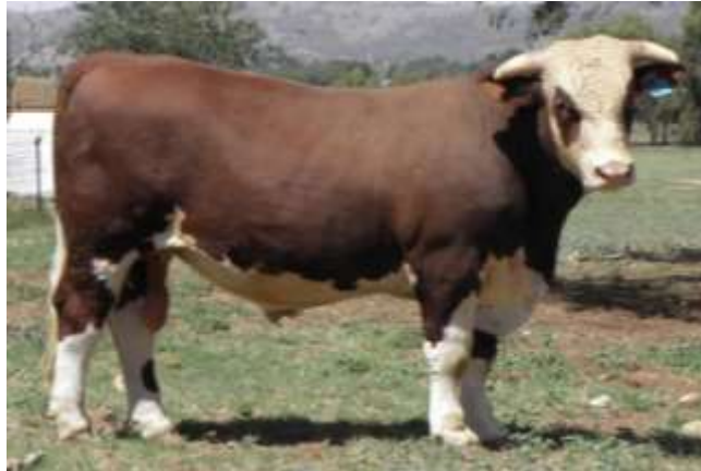
Lot 6 – Glenholme Neville