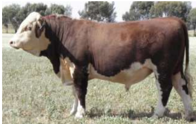
Lot 20 – Glenholme Nash