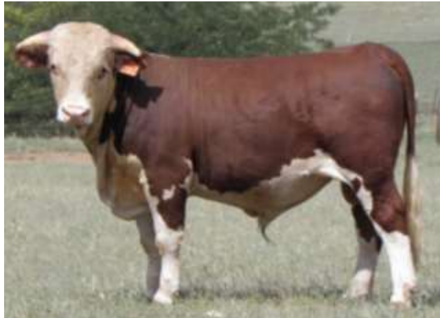
Lot 18 – Kirraweena Norris