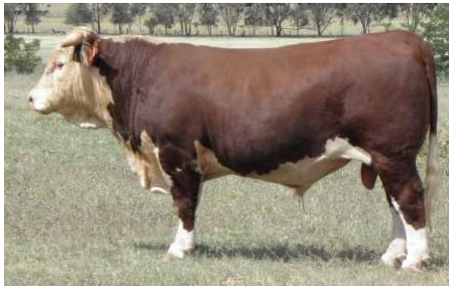
Lot 16 – Kirraweena Novak