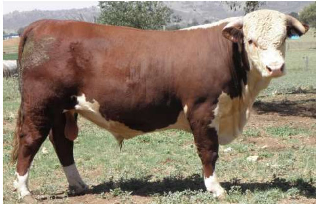
Lot 7 – Glenholme Nadal