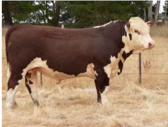
Bowmont Winchester purchased in 2014.