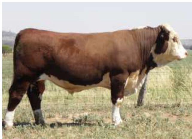
Lot 9 - Glenholme Newtown