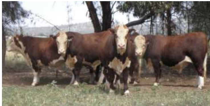
From left to right - Lots 11, 12, 14 & 10

Notes: Top 5% for milk, 600D and IMF, Top 10% CWT