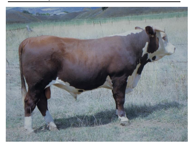
Lot 29 - Glenholme Lincoln