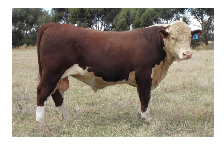
Lot 9- Glenholme Lambert