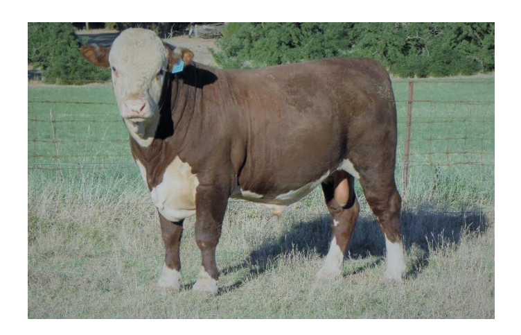
Lot 11 – Glenholme Lloyd

Indexes: Supermarket +$50, Grass Fed +$44, Grain Fed +$51, EU +$57.