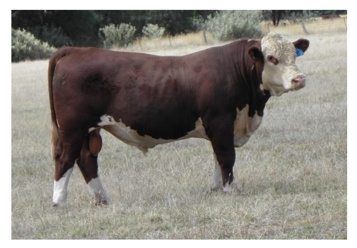
Lot 8 - Glenholme Lincoln

Indexes: Supermarket +$57, Grass Fed Steer +$51, Grain Fed Steer +$56, EU +$70