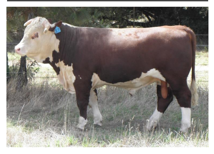
Lot 27 – Glenholme London