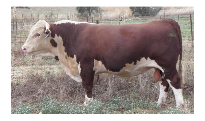
Lot 6 - Glenholme Lawrence

Notes: Heifer's first calf. Best Godfrey we have bred. Beautiful combination of length and a great muscle pattern.