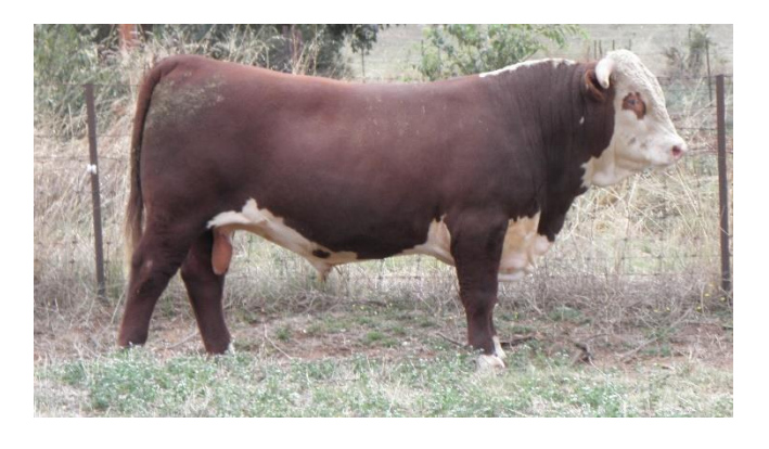
Lot 5 - Glenholme Lancashire

Notes: Top 10% of the breed for 600 Day Weight and Retail Beef Yield. His mother D034 is one of the best cows in our herd. His full brother was shown and sold at Wodonga last year.