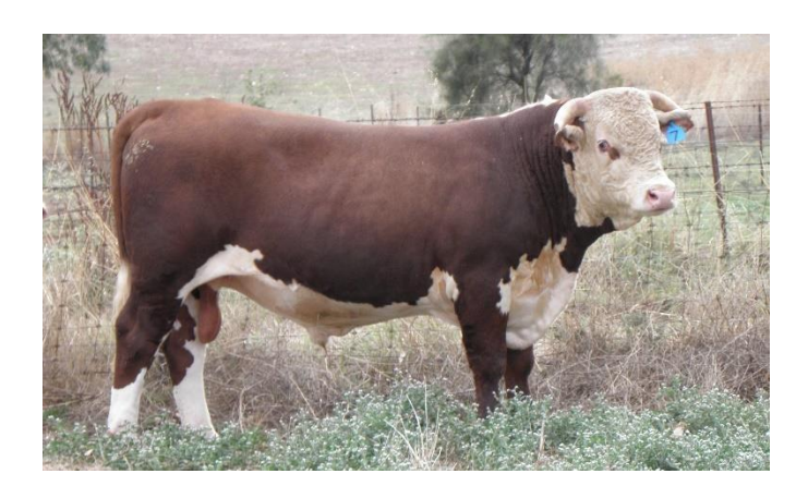
Lot 7 – Glenholme Livingston

Indexes: Supermarket +$49, Grass Fed Steer +$43, Grain Fed Steer +$40, EU +$59