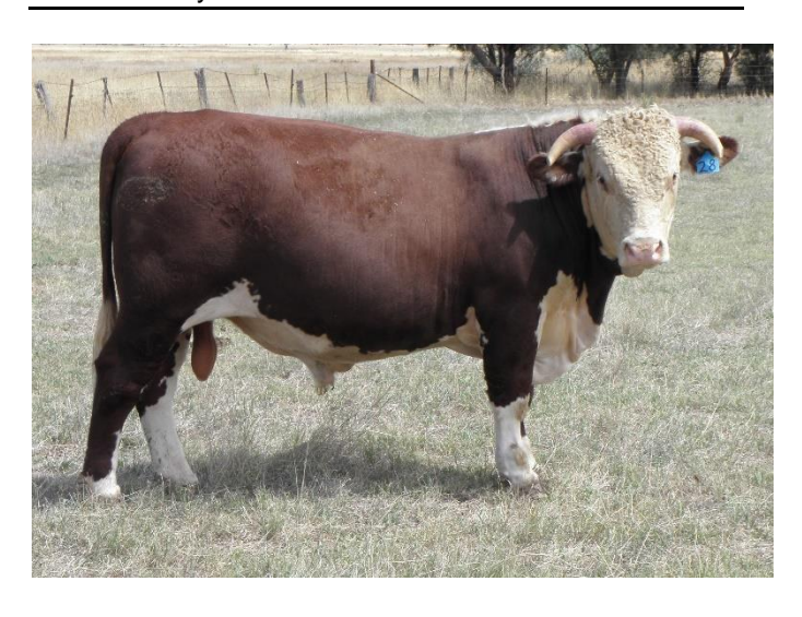
Lot 28 - Glenholme Lindwall