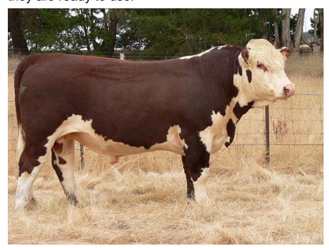
Bowmont Winchester purchased in 2014, first calves offered in this sale

Bulls have been prepared to show their potential whilst they are ready to use.