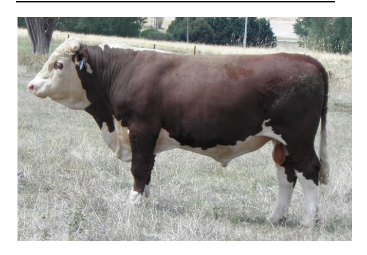
Lot 26 - Glenholme Lansdowne