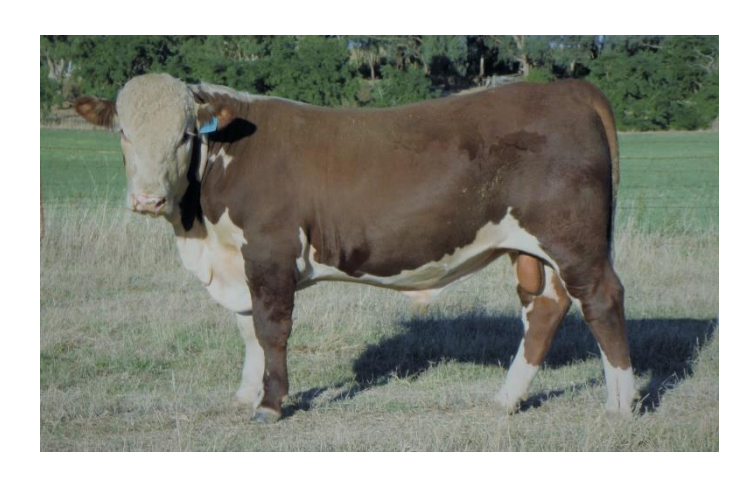
Lot 12 - Glenholme Leyland

Indexes: Supermarket +$64, Grass Fed +$56, Grain Fed +$59, EU +$76.