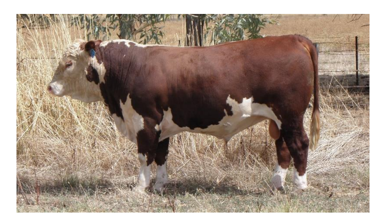
Lot 10 - Glenholme Leighton

Notes: Homozygous Polled (PP 98%). Has the cosmetics to match the superb figures.