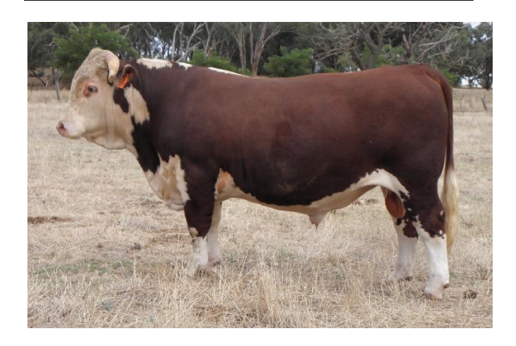
Lot 19 - Kirraweena Llewelyn