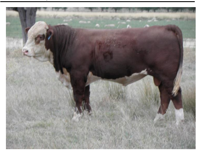
Lot 17 - Glenholme Latham

Indexes: Supermarket +$63, Grass Fed +$55, Grain Fed +$57, EU +$74