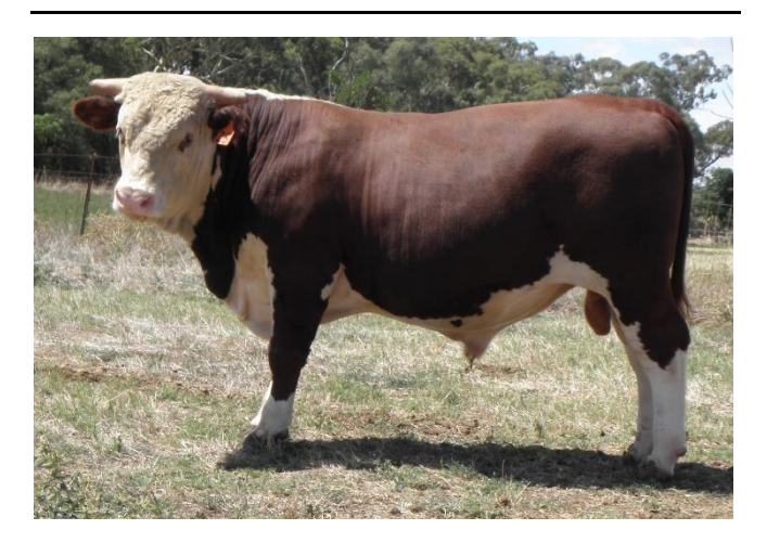
Lot 25 - Kirraweena Monty

Notes: This bull is the youngest in the sale and will only be 15 months old when sold. His mother has consistently bred well.