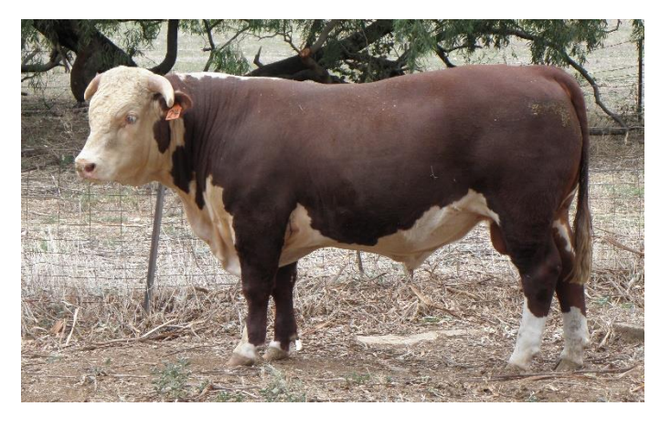
Lot 24 - Glenholme Lalor

Indexes: Supermarket +$55, Grass Fed +$52, Grain Fed +$55, EU +$63.