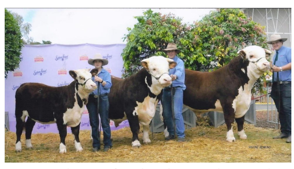
2016 Champion Breeders Group Sydney Royal Kirraweena Glenholme Herefords CONSISTENTLY BREEDING QUALITY, EASY DOING, QUIET HEREFORDS SINCE 1953