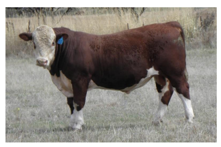
Lot 15 - Glenholme Lorenzo