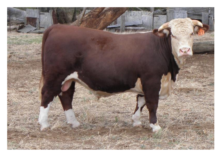
Lot 21 - Kirraweena Laver