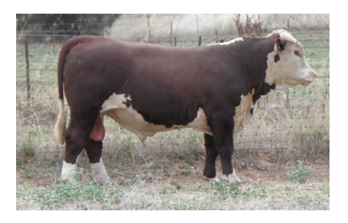
Lot 4 – Glenholme Lamorak

Notes: Top 10% of Breed for Retail Beef Yield % (RBY). Twin brother will be shown and sold at Wodónga.