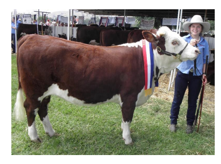
Cassie pictured with Glenholme Victoria K080, Junior Champion Heifer at Gundagai and Canberra Royal Shows 2016

Notes: Top 5% 600 Day Weight, Carcase Weight and Mature Cow Weight Top 10% 400 Day Weight, IMF%, Supermarket, Grain Fed and EU indexes.