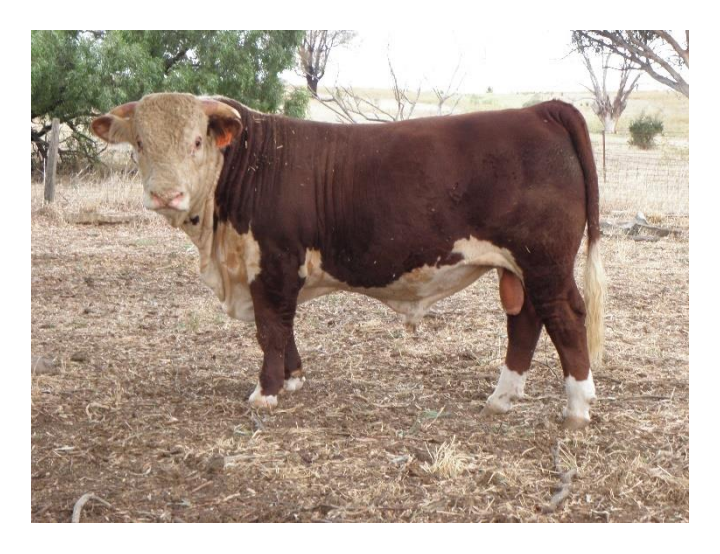
Lot 22 - Kirraweena Longreach

Indexes: Supermarket +$51, Grass Fed +$48, Grain Fed +$42, EU +$58.